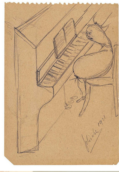
Arnold Schönberg - Caricature. (CR121)